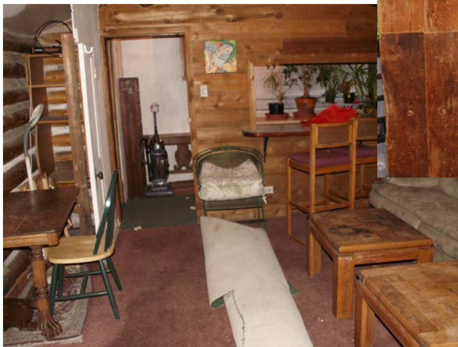
Most of the old logs have been covered up with barn wood but there are some areas where they show through. This summer he is going to take more of the wood off to expose the wood.