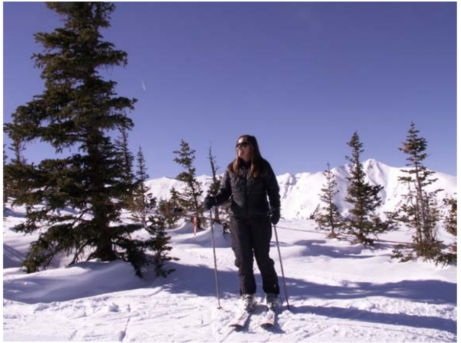
On top of the world!