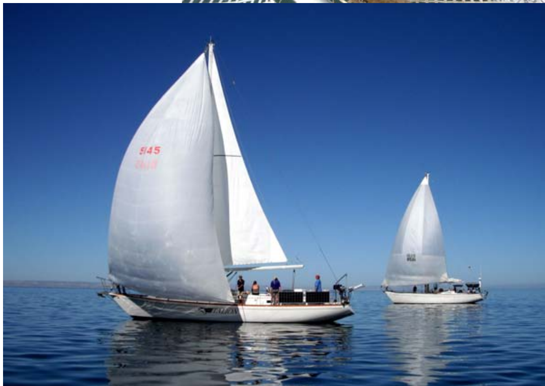
We were in front!