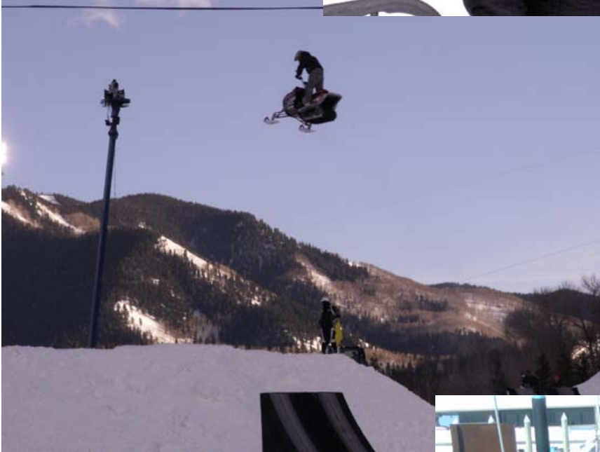
The half pipe. I watched their progress as it took them well over a month to build it with bulldozers and snow making machines.