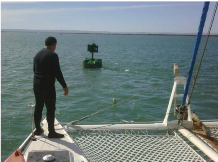
Moving "Moontide" while the Navy finds the proper mooring for the buoy.