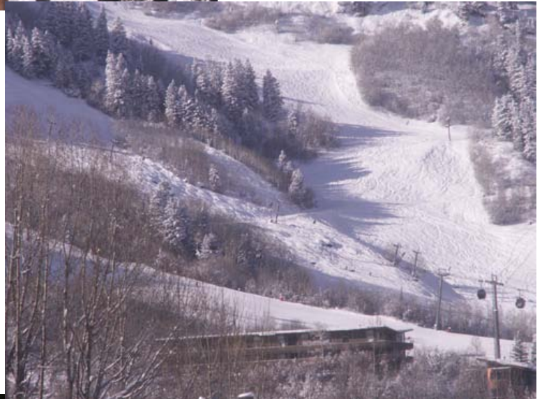
The view from the upper deck zoomed in. You can see the chairlift and ski runs.

Then the economy went into a slump so they are just holding the house. Tim works for the city so they offered it to him to keep an eye on and live in rent free. Now that is hard to turn down! The best part is that the house is 5 blocks from the Aspen Gondola and pedestrian mall. It is right downtown and walking distance to everything. Aspen is a very interesting place. It reminds me of a beach town in Oregon. A small town with regular people and many tourists. The difference is the Aspen tourists have lots and lots of money. It is not