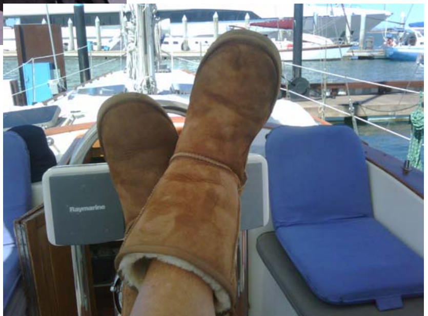
My Christmas Boots!