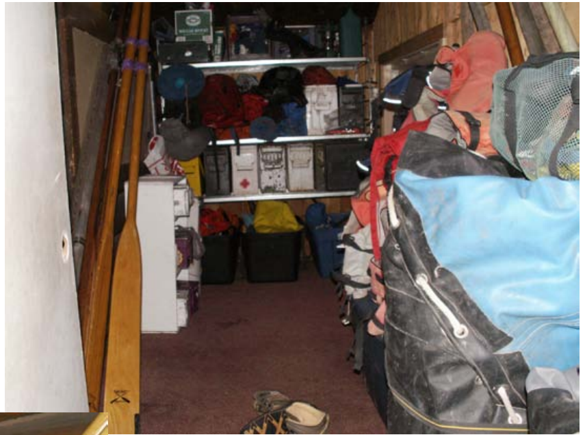
I made one of the downstairs bedrooms just for his river rafting gear. A river runners dream!

I have to say it was a lot of fun painting, moving, arranging and setting up the house. Now that is something I have not done in over 20 years. I think I must have rearranged the furniture every day till I had it just right! There is still a lot to be done downstairs but he has a great apartment upstairs for the time being and he can work on the rest. It is hard to put much into it though as the city will eventually tear it down.