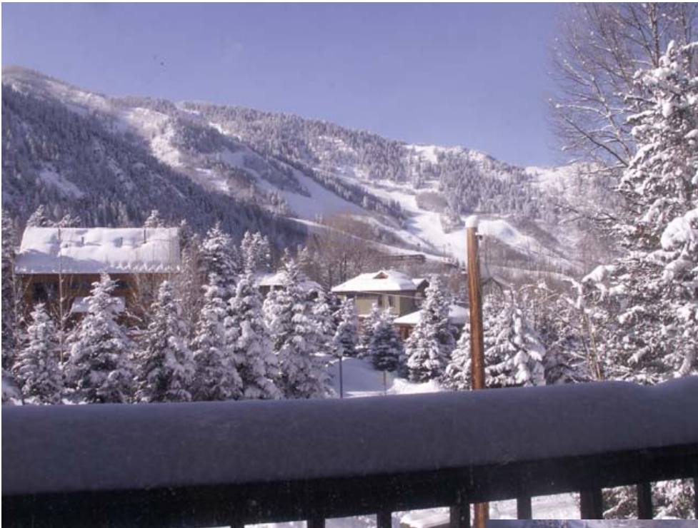
The view from the upper deck.

Then the economy went into a slump so they are just holding the house. Tim works for the city so they offered it to him to keep an eye on and live in rent free. Now that is hard to turn down! The best part is that the house is 5 blocks from the Aspen Gondola and pedestrian mall. It is right downtown and walking distance to everything. Aspen is a very interesting place. It reminds me of a beach town in Oregon. A small town with regular people and many tourists. The difference is the Aspen tourists have lots and lots of money. It is not